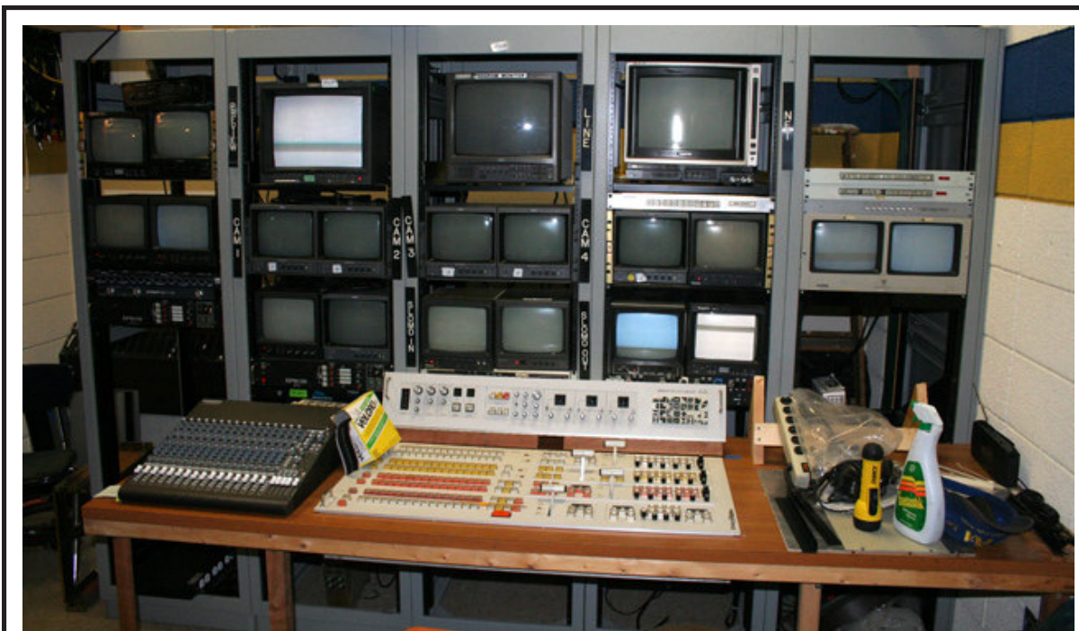
Nine -count'em, NINE ... preview camera monitors, with a possible expansion to ten, mounted in a five bay rack unit along with audio, graphics and a three tiered Grass Valley switcher, nearing final installation at the Foxborough High School auditorium "Beck Studio" , freshly paintly, complete with Blue & Gold racing stripe.

Despite the numerous weekend marathon sessions over the past year or more, there still remains some tedious tasks to be done before the system can be tested. Each of the nine, plus spare, camera cable runs, along with its intercom and audio, is pulled through the ceiling of the auditorium to its place under the switcher in the small accessory room which has been transformed into a nerve center of teleproduction. The room has been cleaned and painted in preparation of the donated equipment which Paul Beck has obtained for our use. According to reliable sources, we are 80% of the way to our first concert coverage without dragging 100 ft. cables through the auditorium.