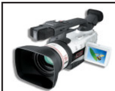
The new lightweight GL-2 cameras are a welcome addition to the portable equipment options.

A sometimes overlooked, yet growing, area of our operation is the use of our camcorder packages by community volunteers. This year two new Canon GL-2 mini DV digital camcorders were purchased to augment the two already in service. They are