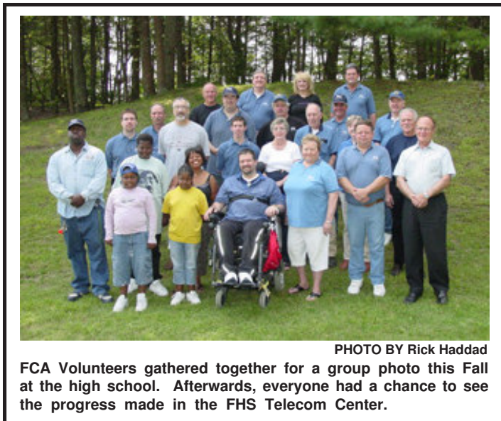
FCA Volunteers gathered together for a group photo this Fall at the high school. Afterwards, everyone had a chance to see the progress made in the FHS Telecom Center.