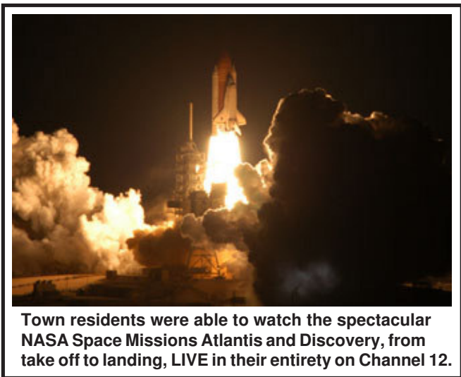
Town residents were able to watch the spectacular NASA Space Missions Atlantis and Discovery, from take off to landing, LIVE in their entirety on Channel 12.

"...The most perfect day - not only of the course, but also of my teaching career - was the day the class taped the Veterans' History Project at the studio on April 15, 2003, ironically, the first day of the War in Iraq. It was a multi-generation experience of mutual learning among students, veterans, their spouses, and the staff of the Foxboro Senior Center and FCA. The stories that were videotaped are kept for reference here in town, but also in the U. S. Library of Congress. It will be an outstanding memory for me always."